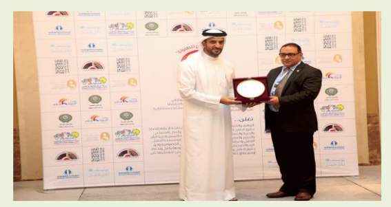
His Highness Sheikh Sultan Bin Ahmed Al Qasimi honored ACCD at the closing session of the Workshop